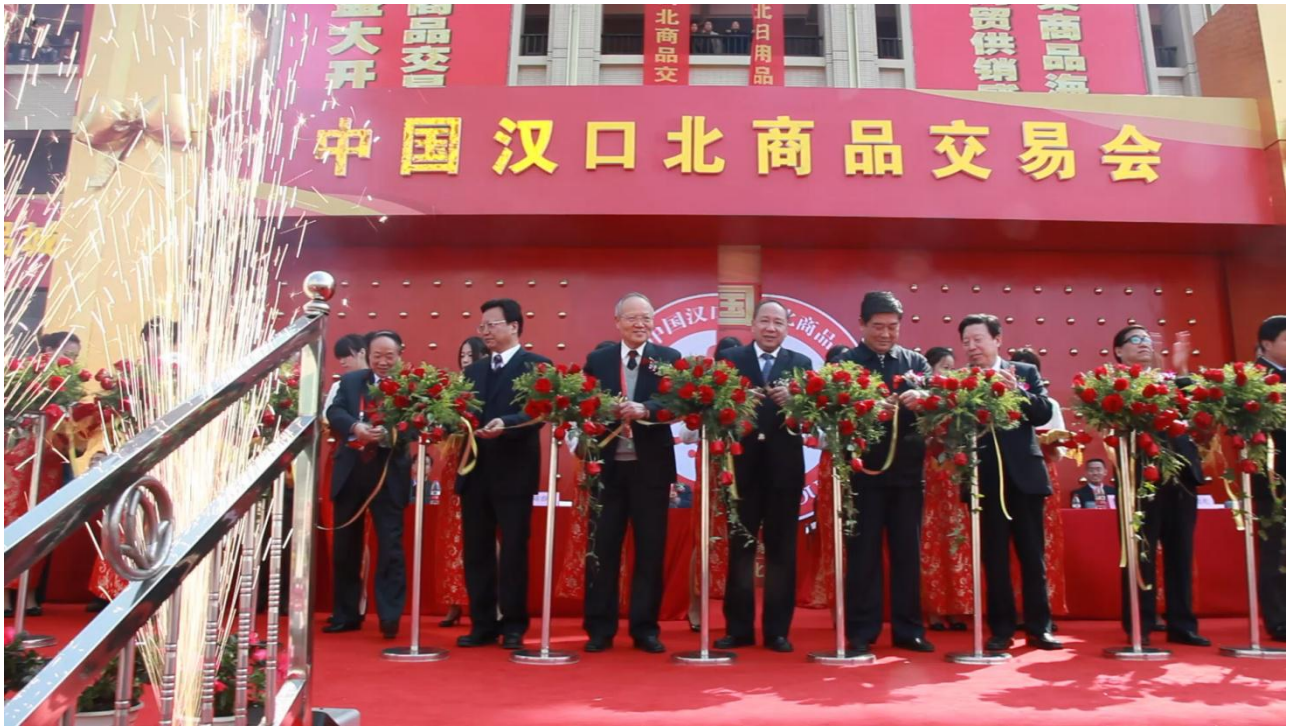
Picture of HKB trade fair